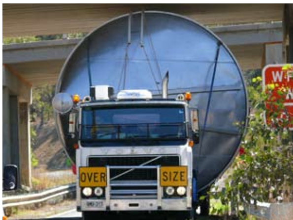
A VicRoads permit is required to transport high loads